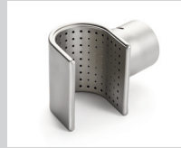
Sieve reflector, 50 x 35 mm Article No: 107.337