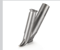
Speed welding nozzle, with small air-slide, Ø 5 mm * Article No: 105.433