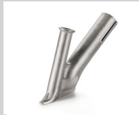
Speed welding nozzle, with small air-slide, Ø 3 mm * Article No: 105.431