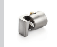
Soldering reflector, 17 x 34 mm Article No: 107.339