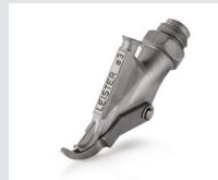
Drawing nozzle with tacking tip, Ø 3 mm Article No: 113.666