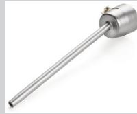
Extension nozzle Ø 5 mm, 150 mm Article No: 106.982