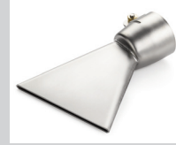
Wide slot nozzle 80 mm, for bitumen Article No: 107.131