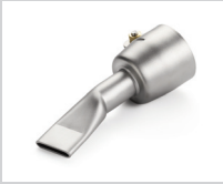
Wide slot nozzle 20 mm, bent, not angled Article No: 107.123