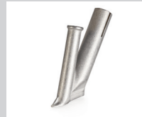
Speed welding nozzle, with small air-slide, Ø 4 mm * Article No: 105.432