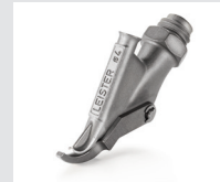
Drawing nozzle with tacking tip, Ø 4 mm Article No: 113.399