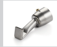
Wide slot nozzle 20 mm, straight jaw, 120° bent at right angle Article No: 105.492