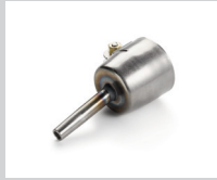
Tubular nozzle Ø 5 mm, reinforced Article No: 105.578