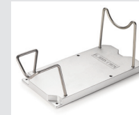
Tool rest TRIAC Article No: 107.348

* use with 100.303 / 105.578 / 106.982 / 105.622