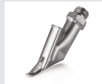
Drawing nozzle, triangular shaped 7 mm Article No: 106.986

* use with 100.303 / 105.578 / 106.982 / 105.622