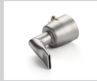
Angled nozzle 20 mm, 90° bent Article No: 107.124