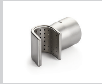
Sieve reflector, 35 x 20 mm Article No: 107.338