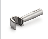
Sieve reflector (Ø 8.25 mm), 10 x 12 mm * Article No: 107.324