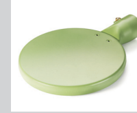
Welding mirror 135 mm, PTFE coated Article No: 107.344