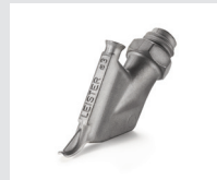
Drawing nozzle without tacking tip, Ø 3 mm Article No: 113.876