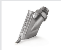
Drawing nozzle without tacking tip, triangular shaped 5.7 mm Article No: 113.877