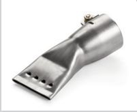
Wide slot nozzle 40 mm, perforated Article No: 107.133