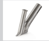
Speed welding nozzle Ø 3 mm * Article No: 106.989