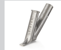
Speed welding nozzle, triangular shaped 7 mm * Article No: 106.993