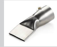
Wide slot nozzle 40 mm Article No: 107.132