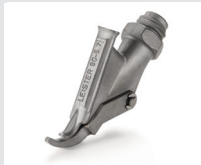
Drawing nozzle with tacking tip, triangular shaped 5.7 mm Article No: 113.670