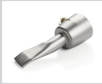
Wide slot nozzle 20 mm, bent and angled Article No: 105.487