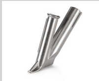
Speed welding nozzle Ø 5 mm * Article No: 106.991