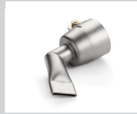
Angled nozzle 20 mm, 60° bent Article No: 107.125