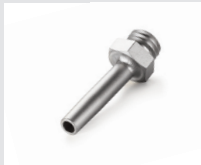
Tubular nozzle Ø 5 mm Article No: 105.622