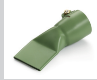
Wide slot nozzle 40 mm, PTFE coated Article No: 107.135