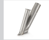
Speed welding nozzle Ø 4 mm * Article No: 106.990