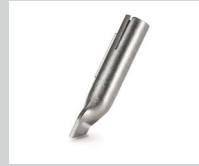
Tacking nozzle * Article No: 106.996