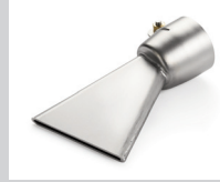
Wide slot nozzle 60 mm, for bitumen Article No: 107.129