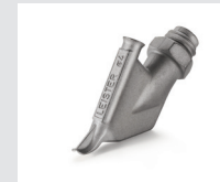
Drawing nozzle without tacking tip, Ø 4 mm Article No: 113.874