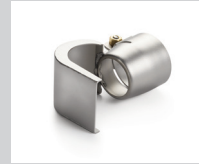
Spoon reflector, 27 x 35 mm Article No: 107.307