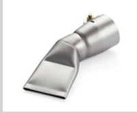
Wide slot nozzle 40 mm, 60° bent Article No: 107.130