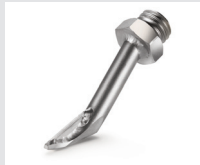
Tacking nozzle Article No: 106.988