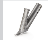
Speed welding nozzle, triangular shaped 5.7 mm * Article No: 106.992